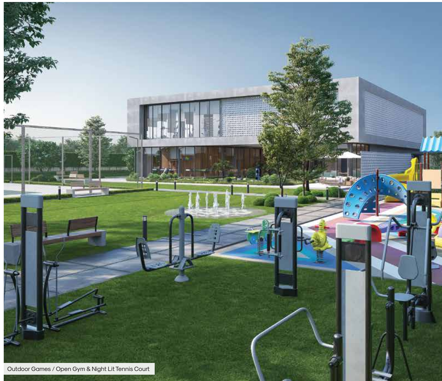
Outdoor Games / Open Gym & Night Lit Tennis Court