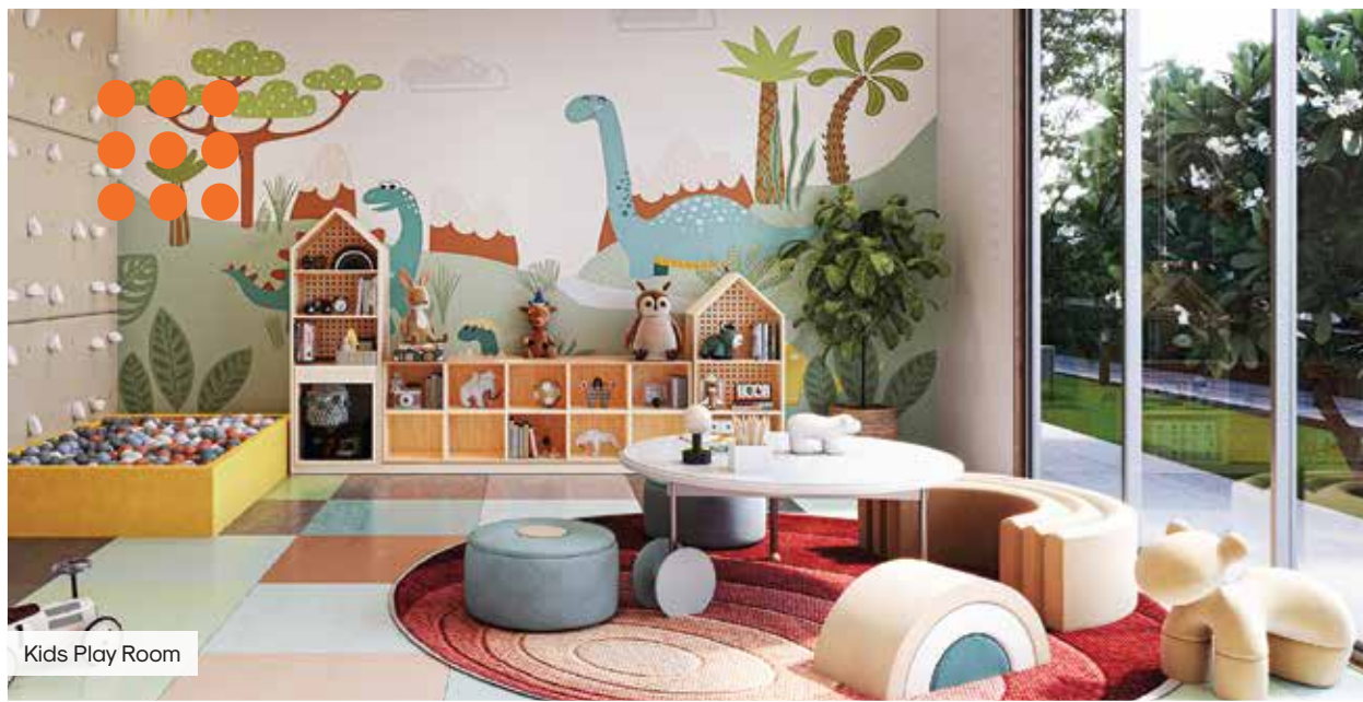
Kids Play Room