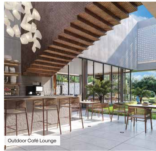
Outdoor Café Lounge