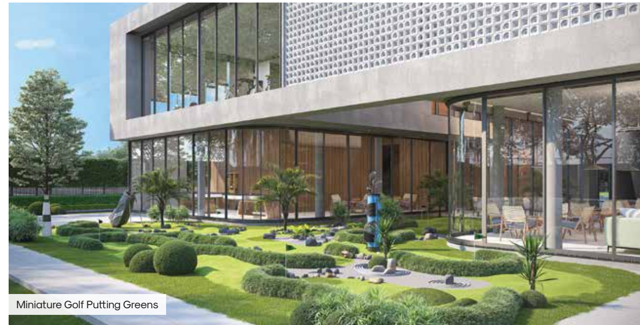
Miniature Golf Putting Greens