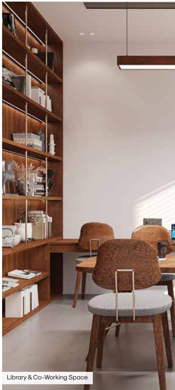
Library & Co-Working Space